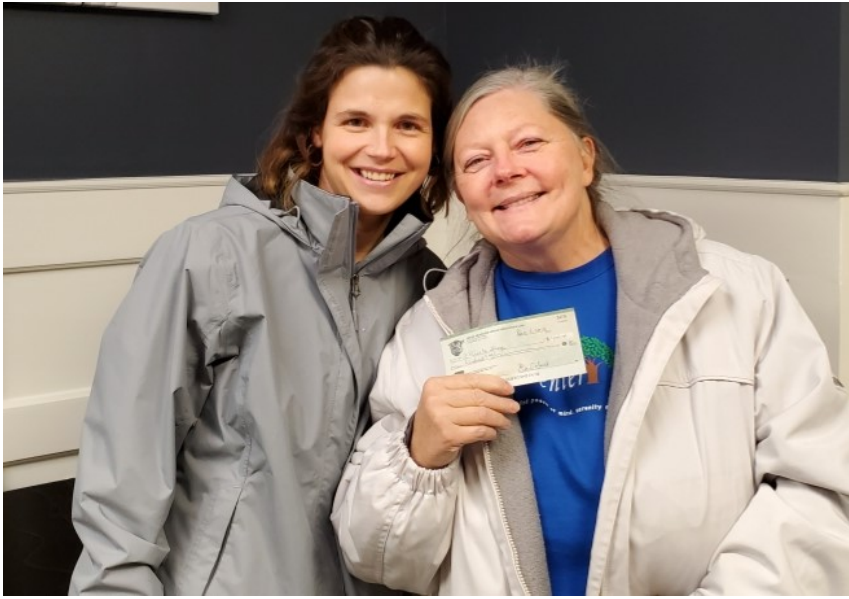
Organizations donating to help children! Thank you, Great Meadows Angus Association.